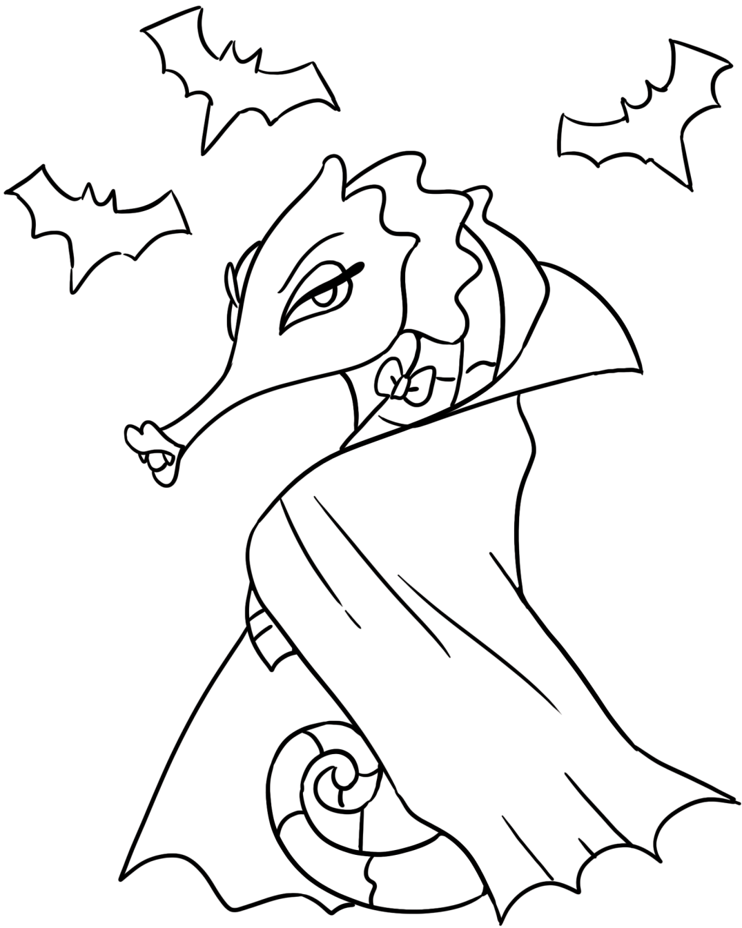
SNARKLE THE SEAVAMPIRE