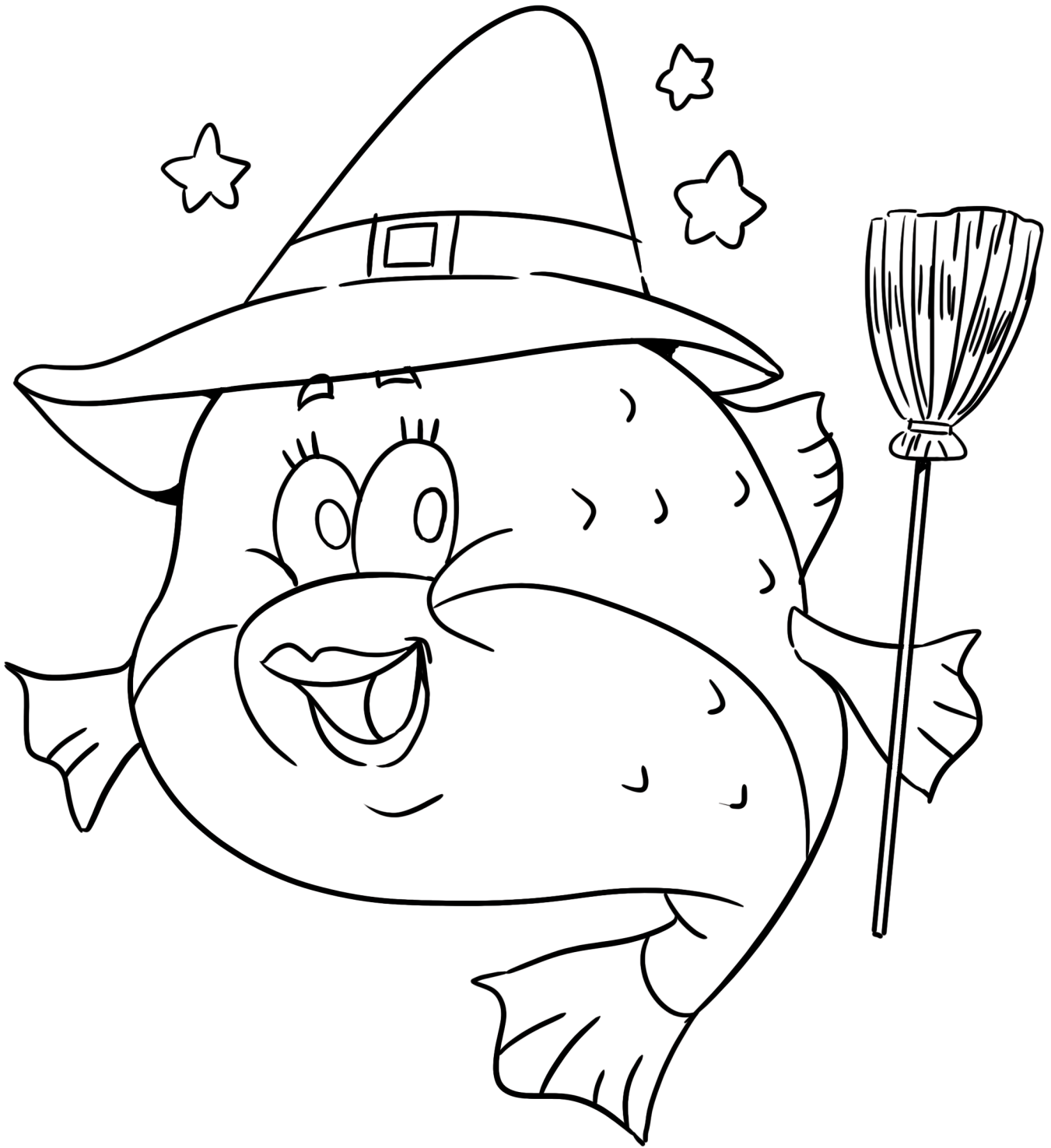
CORAL THE PUFFERWITCH