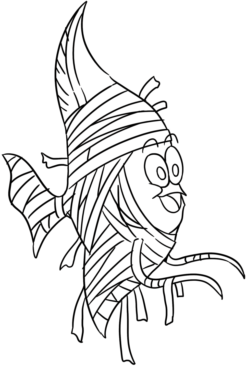
FINN THE MUMMYFISH